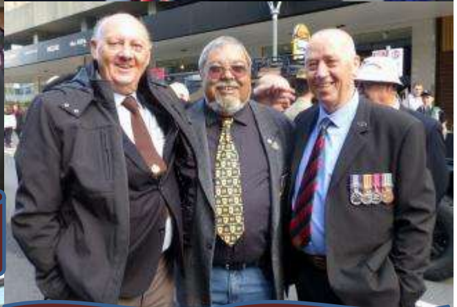
Where did you get that tie Teagee?