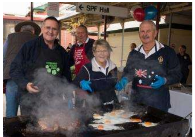
9 RAR "volunteers" cooking up a storm at the Repat Staff Awards.

"Where there is smoke there might be bacon!"