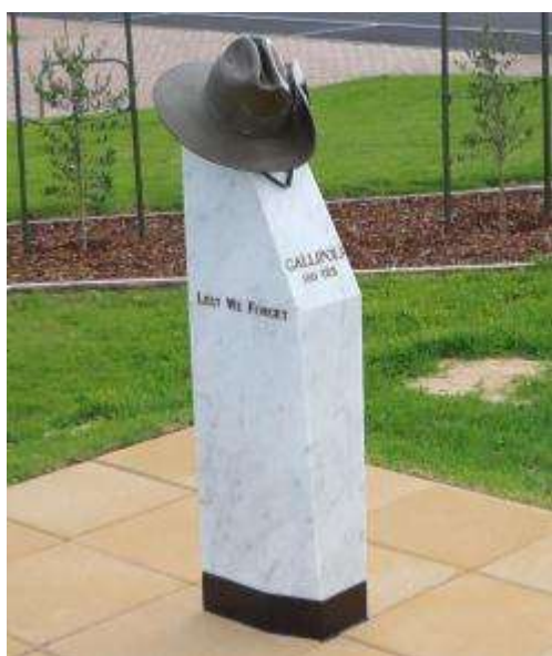
Gallipoli 100 years - Robe