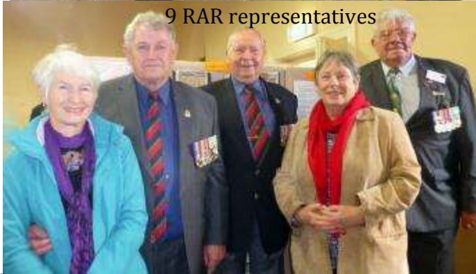
9 RAR representatives