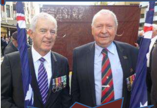
The march goes the other way fellows!