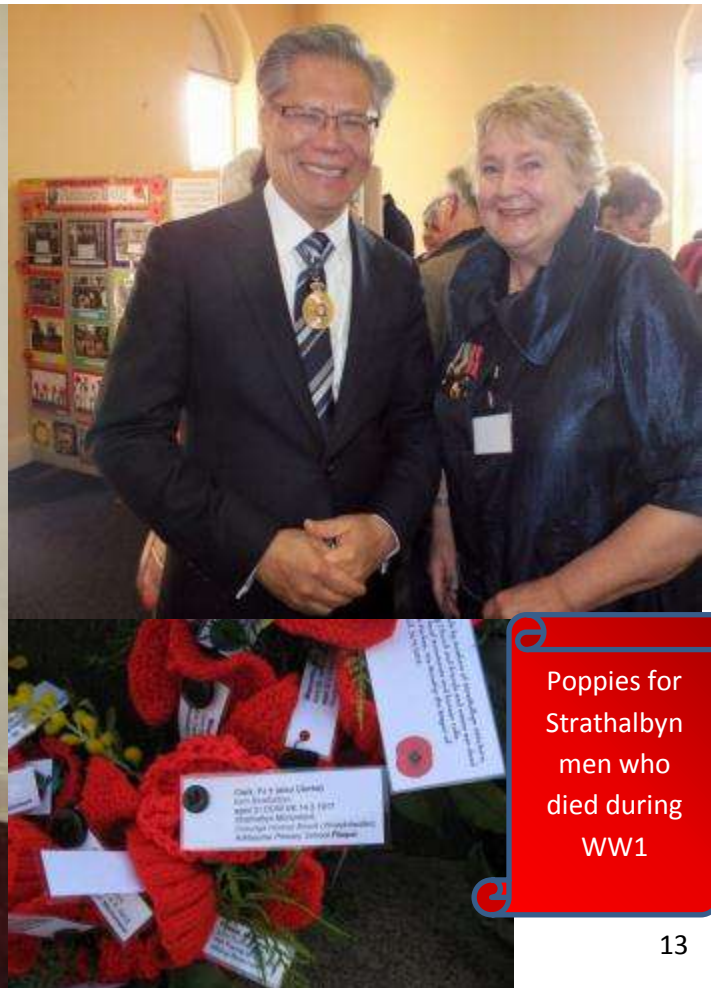
Poppies for Strathalbyn men who died during WW1