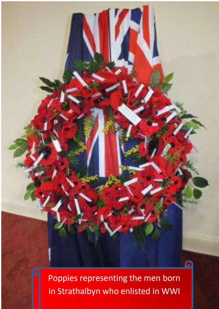
Poppies representing the men born in Strathalbyn who enlisted in WWI