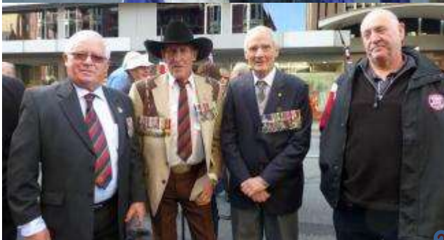
"Slatts" –rarely seen, never forgotten.