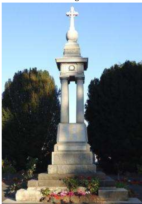
Mount Gambier War Memorial