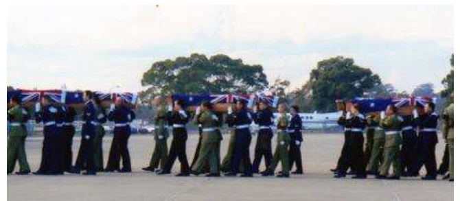
Home at last