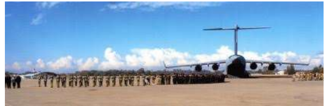
Richmond Air Base

The Department of Veterans Affairs advises that all costs associated with the repatriation and reburial of the 33 Australians who were returned home were met by the Australian Government.