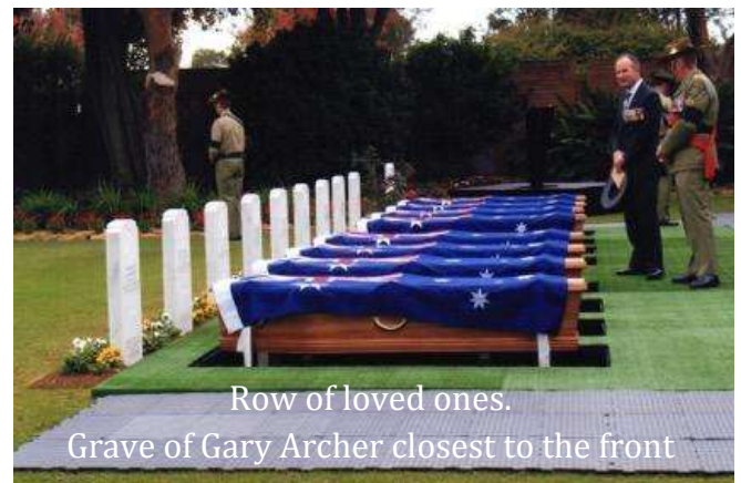
Row of loved ones.