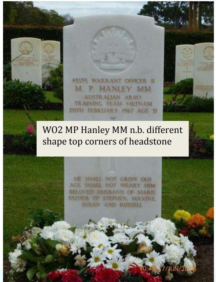
WO2 MP Hanley MM n.b. different shape top corners of headstone

Those who have seen the graves of Vietnam War dead in the Perth War Cemetery and the Woden Cemetery, Canberra, will be aware of inconsistencies in headstone material and shape.