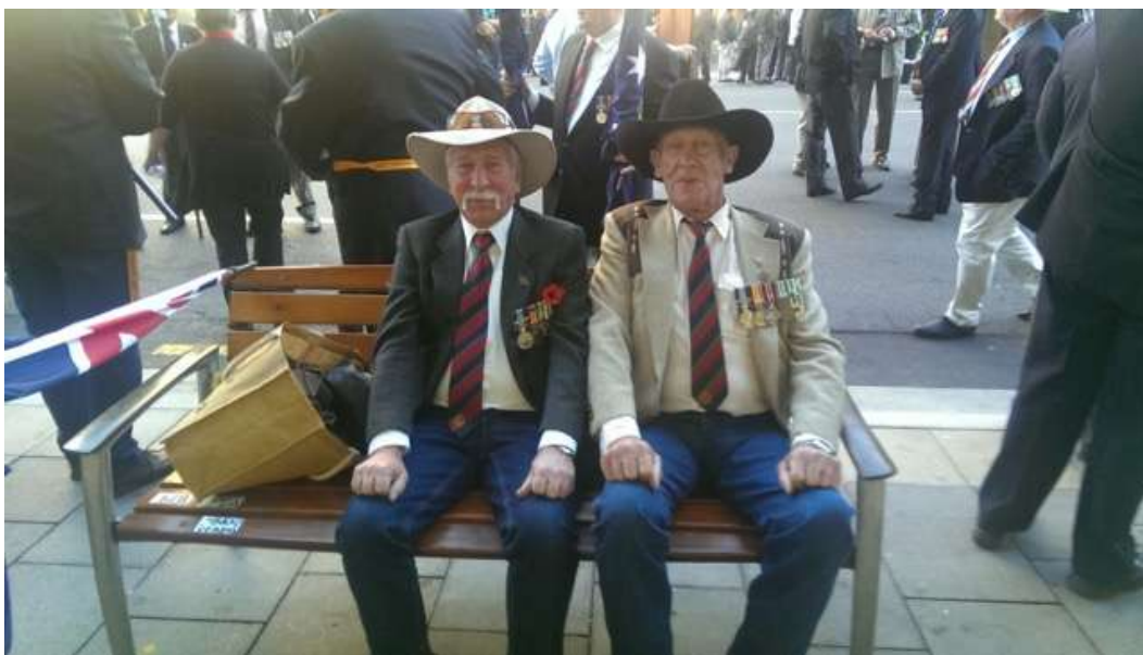
'Strawbs' and 'Tex'