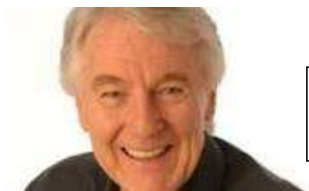
Col Joye and Little Pattie coming up next

Planning will be finalised at the August meeting and promoted by email shortly after.