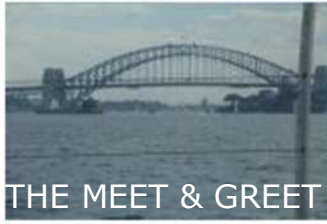
THE MEET & GREET