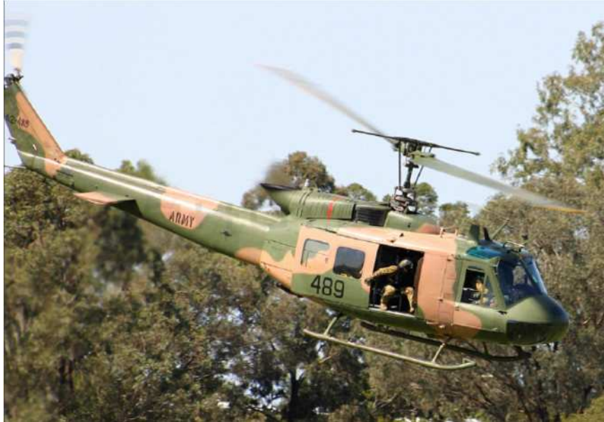
(The actual machine to be displayed)