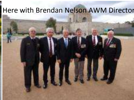
Here with Brendan Nelson AWM Director