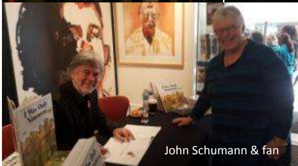
John Schumann & fan