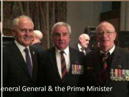
9 RAR mixing it with the Governor-General & the Prime Minister