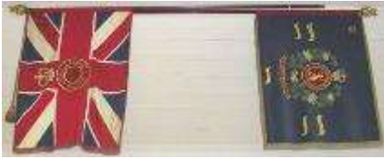
Laid up in the All Saints Chapel, Gallipoli Barracks, Enoggera