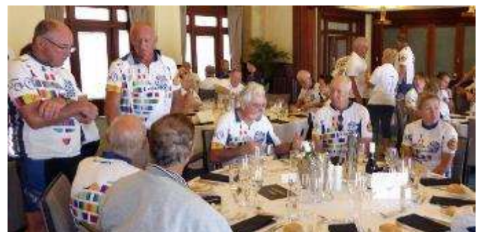
This is a good example of the RARA “Keeping the Spirit Alive”