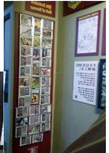
The 9 RAR display prepared by Tom Goode