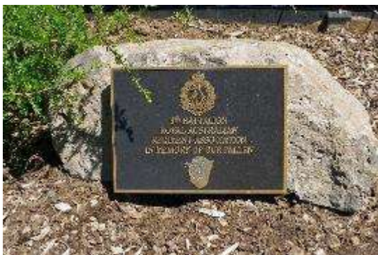
9 RAR Memorial Plaque in the Garden of Remembrance