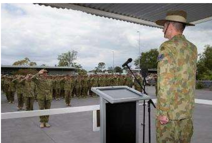
Chief of Army Lieutenant General Angus Campbell, DSC, AM, is saluted on the dais as part of the Task Group Taji Rotation 2 farewell parade at Gallipoli Barracks, Brisbane.