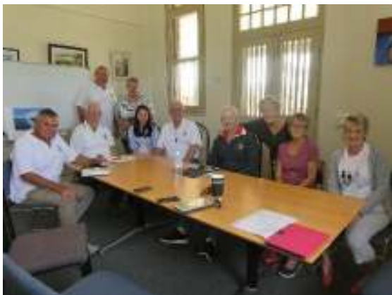
March 2019 9 RAR SA general meeting at The Hub. Bob took part via computer.

Please note that the September meeting will take place at 11 am at the Strathalbyn RSL (located in the football clubrooms, Strathalbyn oval) followed by lunch at a local venue. Details t.b.a. No change to the 6 June meeting - 1 pm at The Hub, Glenside.