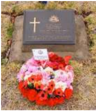
For B Plane