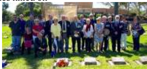
For J Cock