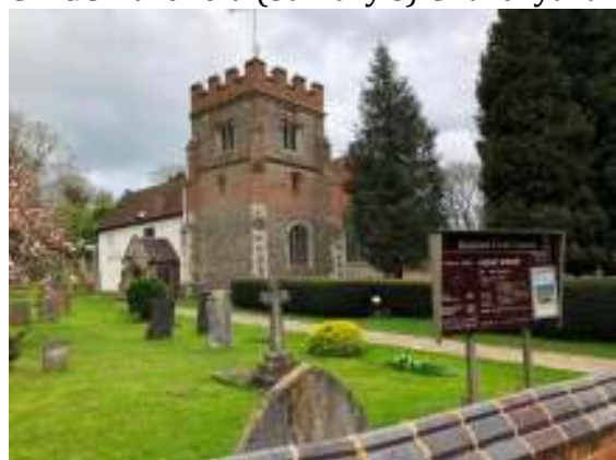
St Mary's Church Harefield UK