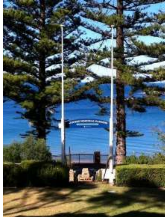
Soldiers' Memorial Garden Port Elliot