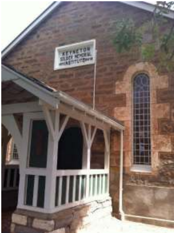
Keyneton Soldier Memorial Institute