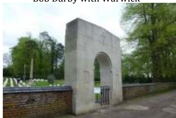
CWGC Harefield (St Mary's) Churchyard